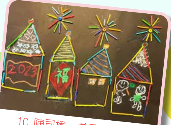
1C 陳司樞 美麗的煙花