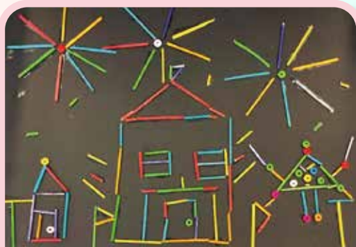
1B 張嘉媛 美麗的煙花