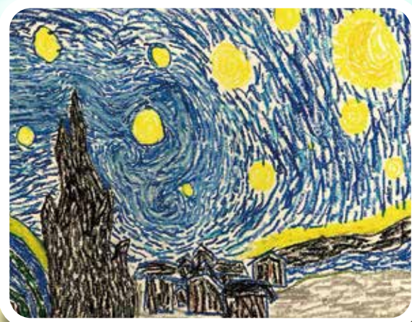
3A 林心允 梵谷的星夜

到了黃昏，我們一家人躺在沙灘蓆上，欣賞美麗的日落。這天，我不但感受到一家人的合作精神，還享受了一個共聚天倫的好活動，真期待再次到海灘嬉水啊！