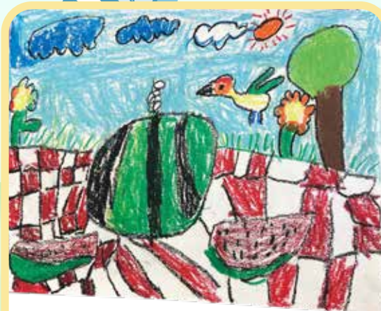
1D 吳顯璋 奇異水果