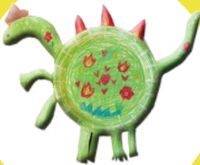
2D 羅善澄 紙碟恐龍