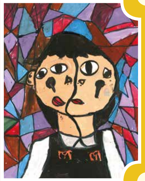
5B 孫綽穎 畢加索的自畫像