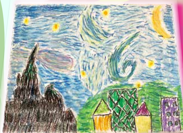
3B 潘穎彤 梵谷的星夜