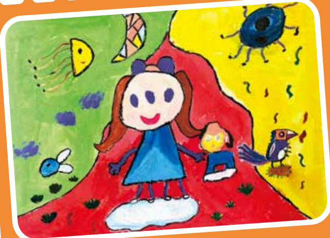
4D 羅晞雅 米羅的秘密