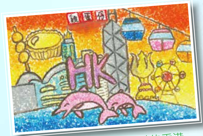
6C 黎芷晴 畫出一點點的香港