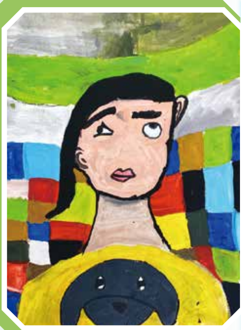
5A 李芷妍 畢加索的自畫像

春天是一個鳥語花香、百花齊放的季節，大自然畫出了一幅幅春意盎然、風光旖旎的圖畫。生活在這步伐急促的鬧市中，何不嘗試放慢腳步，遠離煩囂，欣賞一下春天帶來的種種美景呢？