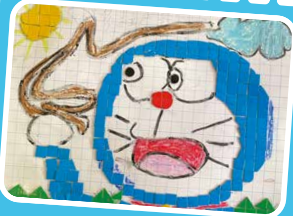
2B 羅菁洋 形形式式方塊磚