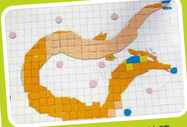
2A 黃瑋壕 形形式式方塊磚