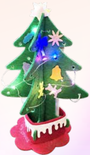
6A 范允熙 串串燈聖誕樹