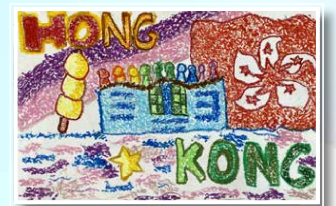
6D 易昊昕 畫出一點點的香港